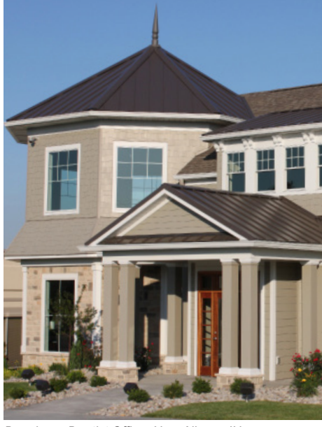
Denzinger Dentist Office, New Albany, IN

tural Standing Seam Steel Roof Panel Systems.