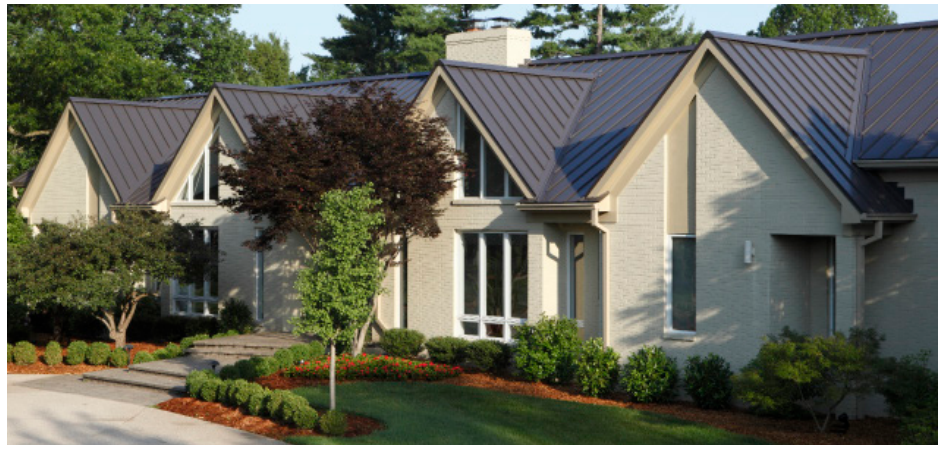
Residence, Louisville, KY