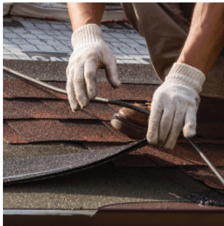
Installs at the eaves and rakes to help prevent shingle blow off