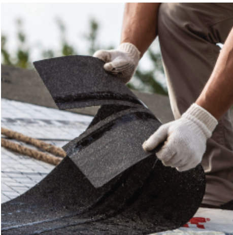
Tears in half easily along perforation for easy installation