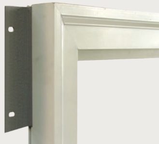
Aluminum clad frame with brickmould nosing and nail fin

NOTE: Colors shown are as accurate as printing methods will permit.