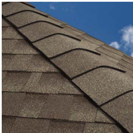
After A distinct finishing look that also protects against leaks and shingle blow-offs